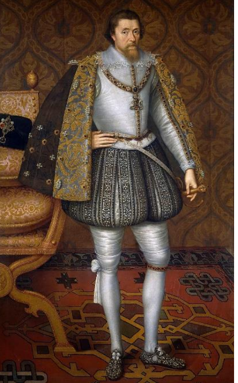
King James I

"Everyone had to go to the Church of England. It was noted if you didn't. So what they were doing here was completely illegal. They were holding their own services."