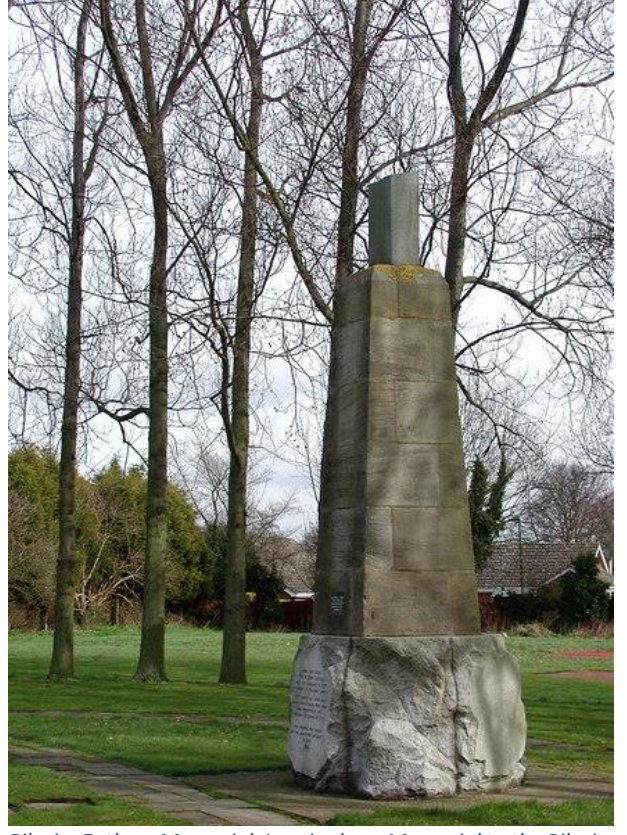
Pilgrim Fathers Memorial, Immingham Memorial to the Pilgrim Fathers off Church Lane, south of St Andrews Church. An inscription on the base reads: "From this creek the Pilgrim Fathers first left England in 1608 in search of religious liberty. The granite top stone was taken from Plymouth Rock Mass and presented by the Sulgrave Institution of USA. This memorial was erected by the Anglo-American Society of Hull 1924". During the expansion of Immingham docks in May 1970 the memorial was removed from its original site on Immingham Creek and placed here on the green.

They were to rendezvous at Killingholme Creek, where a Dutch ship, contracted out of Hull, would be waiting.