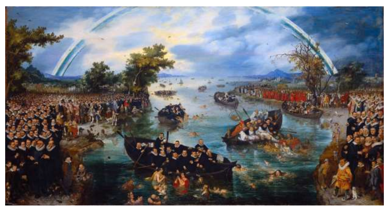
Fishing for Souls, 1614, a satirical allegory of Protestant-Catholic struggles for souls during the Dutch Revolt

"Leiden, like Amsterdam, excelled as a center of English-language printing in the seventeenth century. The city of more than 50,000 population had a sizeable English-Scottish community, some drawn by the university, the oldest and foremost in the Netherlands, others for commerce and for jobs in the textile workshops."