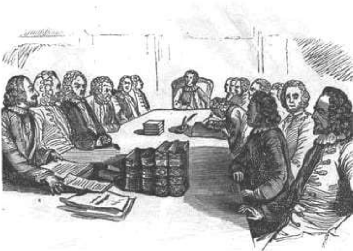
SIGNING OF THE NEW ENGLAND CONFEDERATION

“It was perhaps a more serious defect that the machinery of the Confederation provided no means by which the federal government could act directly on the individual citizen. The Confederation was in fact rather a league of independent powers for certain special and limited purposes than a federal state. More than this was scarcely possible among states constituted as were those of New England.”