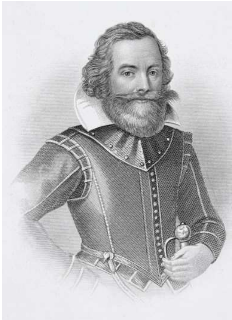
John Smith

“After a month or so] they sent him back again to his friends; who when he came from London they liberally gave him (but out of his own estate) ten shillings to be rid of him; such oft is the share of fatherless children. [Fortunately, the Barty brothers] gave him sufficient to return for England.”