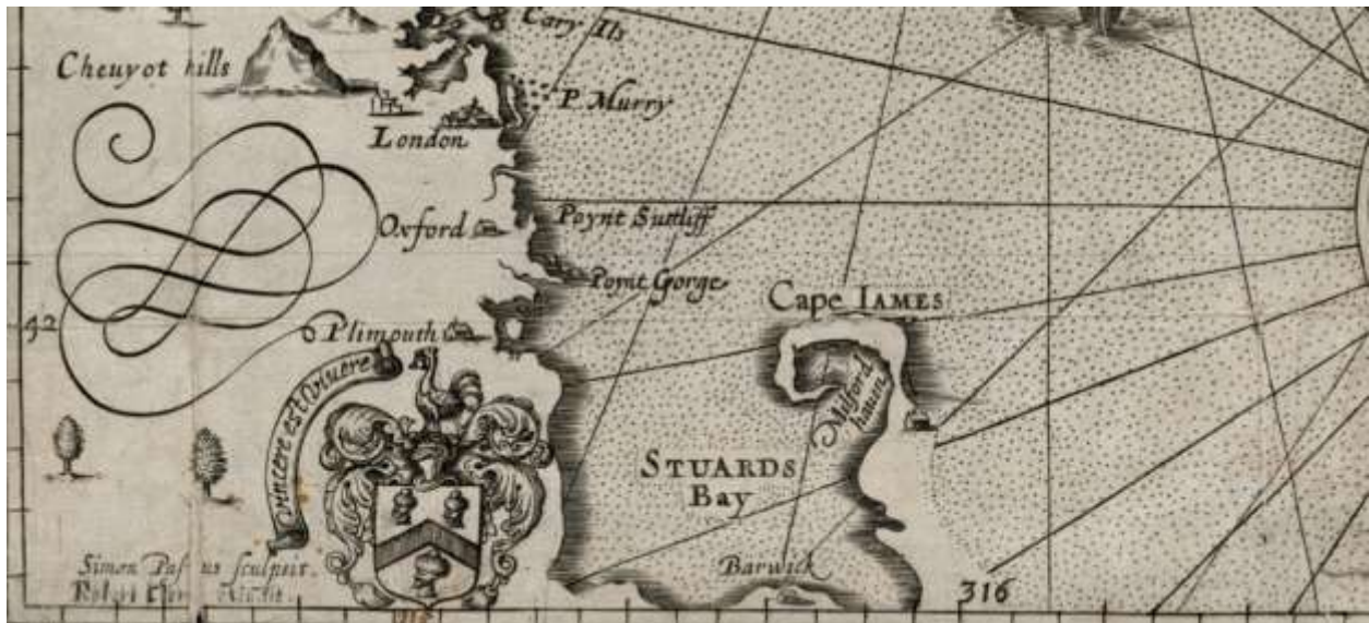
Portion of John Smith's 1614 Map Noting 'Plymouth'

Intending to establish an English colony there, Smith's efforts were frustrated when he was captured by French pirates while sailing to New England in 1615.