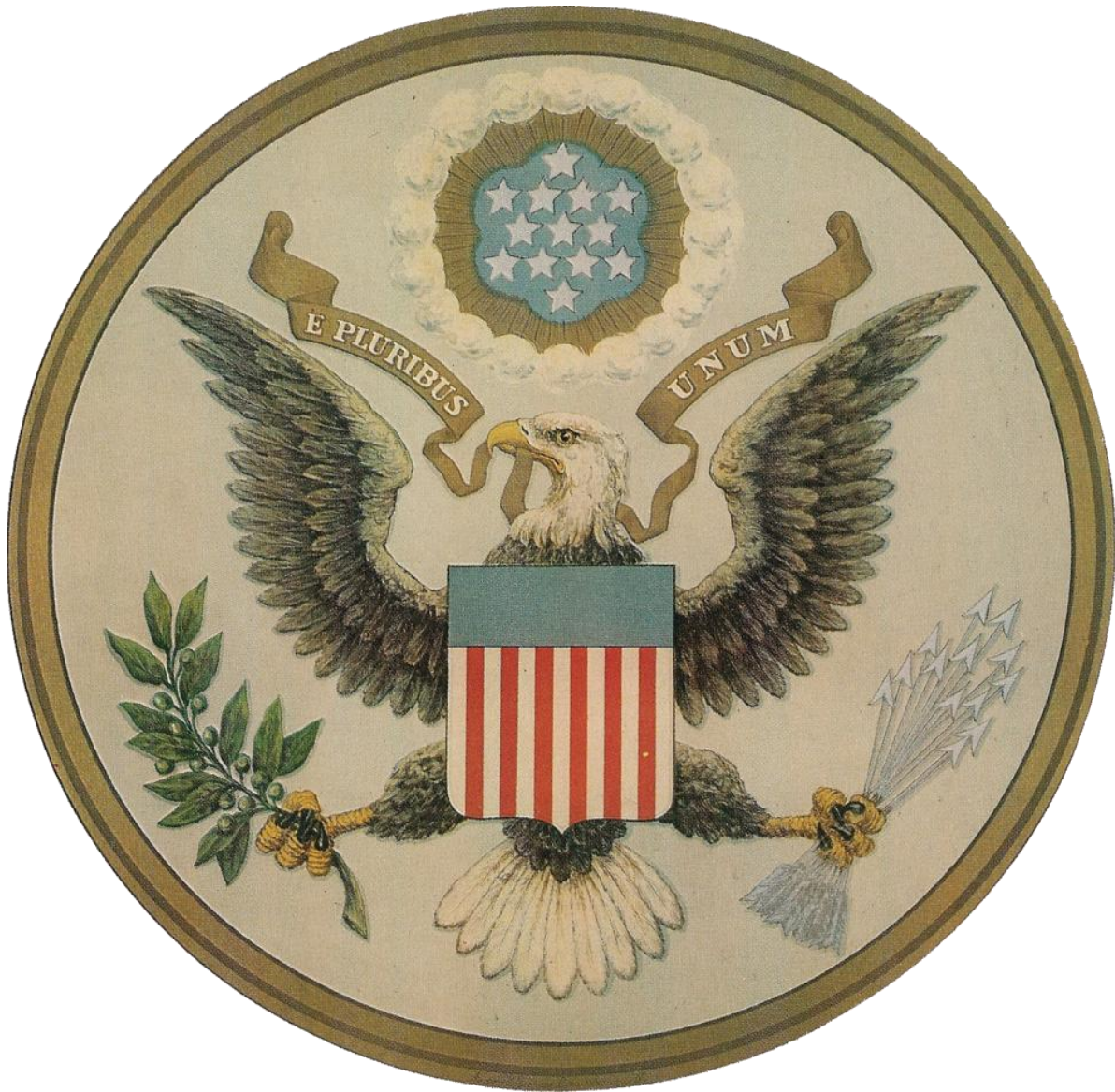
Great Seal of the United States (Graham Lithograph – 1899)

Information here is primarily from US Archives, US State Department, Government Printing Office and Britannica.