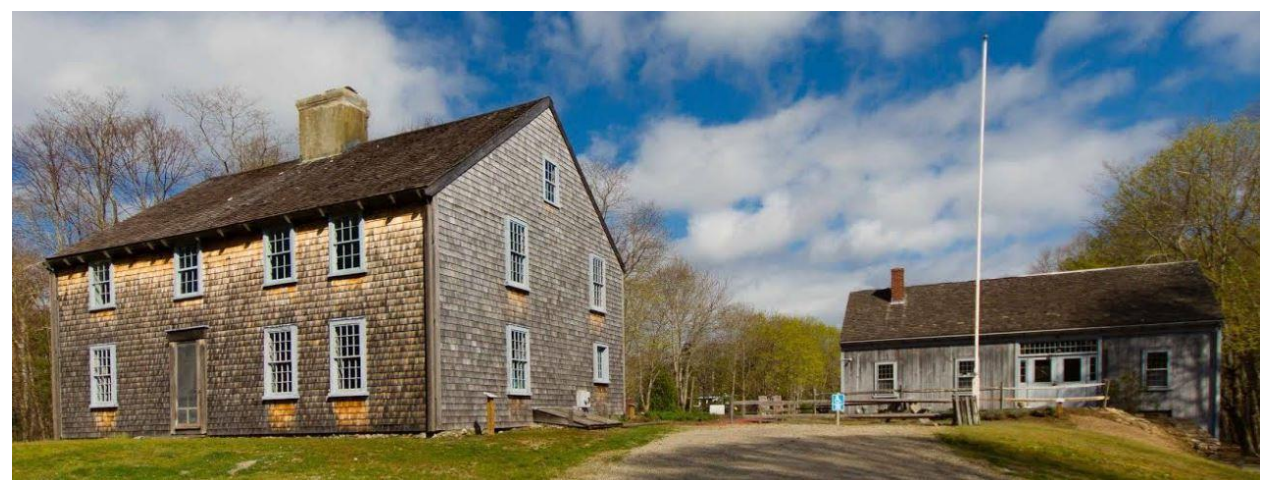
The National Historic Landmark Alden House Historic Site is the ancestral home of Mayflower Pilgrims John & Priscilla Alden in Duxbury. The museum is open seasonally for visitors and offers guided tours.

The shipbuilding era in Duxbury ended as quickly as it began. By the 1850s sailing vessels were made obsolete by other modes of transportation such as steamships and railroads. There are few physical traces of this industry remaining today.