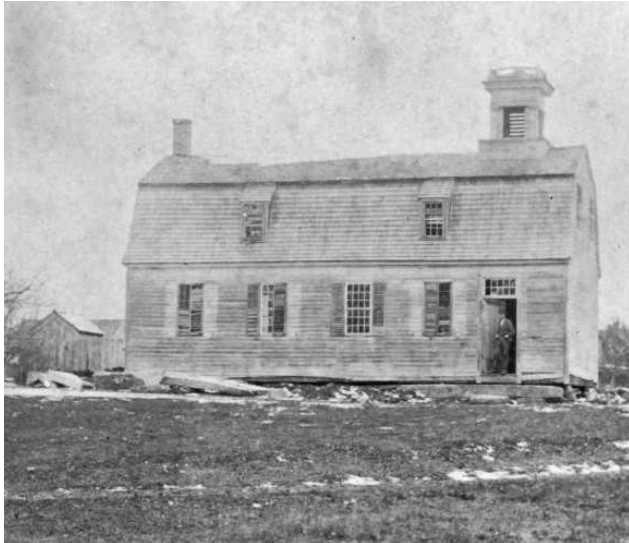
Foreign Mission School

By 1816, contributions to the ABCFM had declined. There were several reasons including post-War of 1812 recession and the fact that India and Ceylon (Sri Lanka) were too remote to hold public interest. (Wagner) Folks saw a couple options: bring Indian and foreign youth into white communities and teach them there, or go out to them and teach them in their own communities. They chose the former.