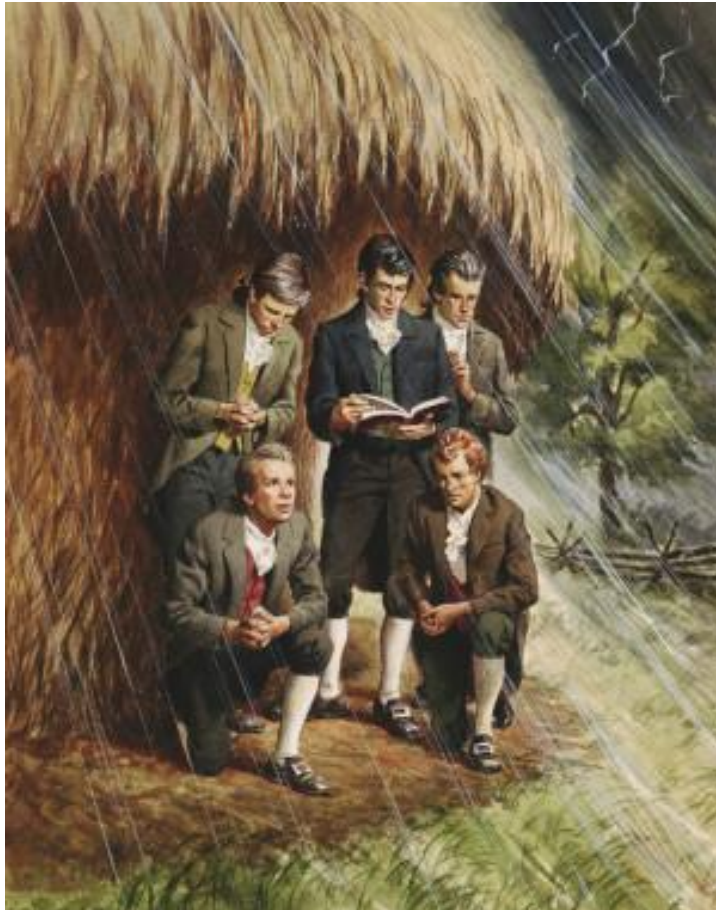
Haystack Prayer Meeting

They crouched beside a large haystack which stood on the spot now marked by the Missionary