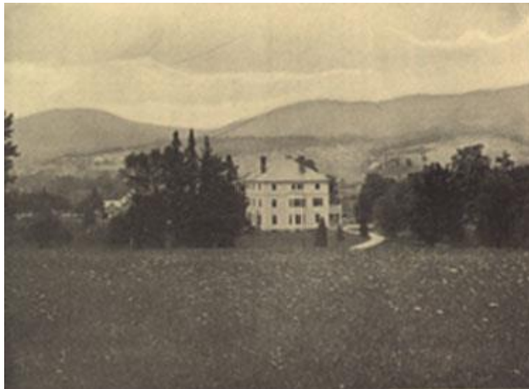
Sloan's Meadow – Williams College

He found the town and college under the influence of a great revival. Though felt but slightly in the college in 1805, in the summer of 1806 it was profoundly stirring men's souls. Prayer-meetings by groups of students were being maintained zealously.