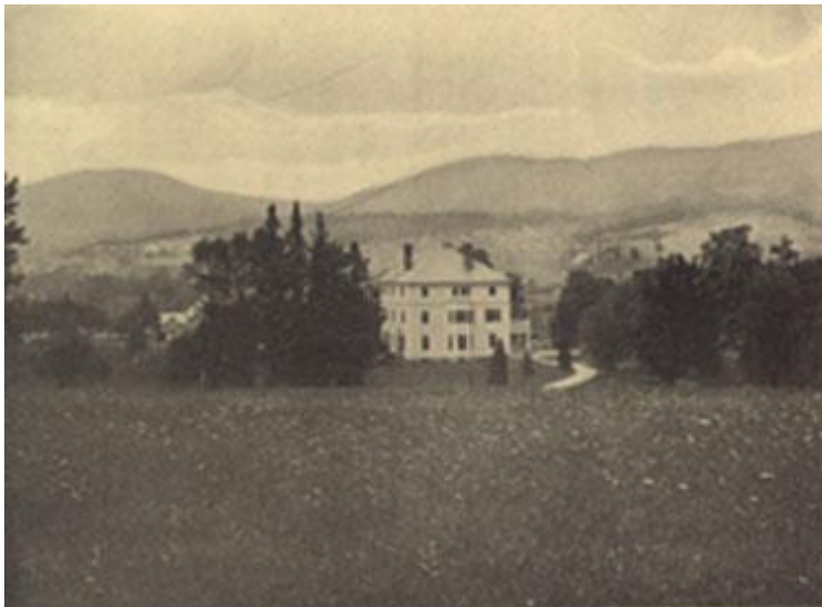
Sloan's Meadow – Williams College

He found the town and college under the influence of a great revival. Though felt but slightly in the college in 1805, in the summer of 1806 it was profoundly stirring men's souls. Prayer-meetings by groups of students were being maintained zealously.